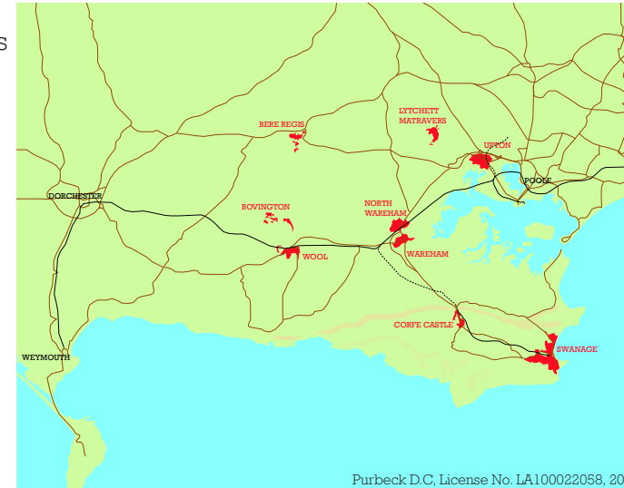
Map of Purbeck identifying the settlements included in the study